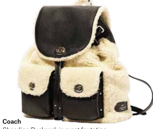
Shearling Rucksack is great for toting all your daily tools ($550, saksfifthavenue.com)