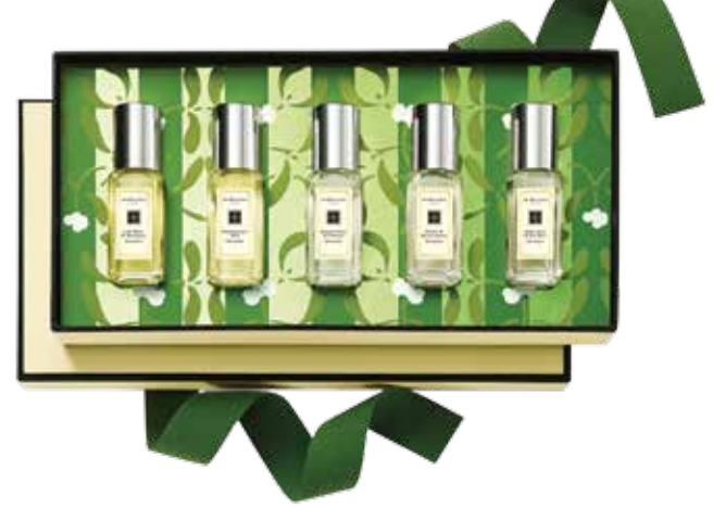
Jo Malone London Cologne Collection comes with five favorite fragrances ($115, jomalone.com)