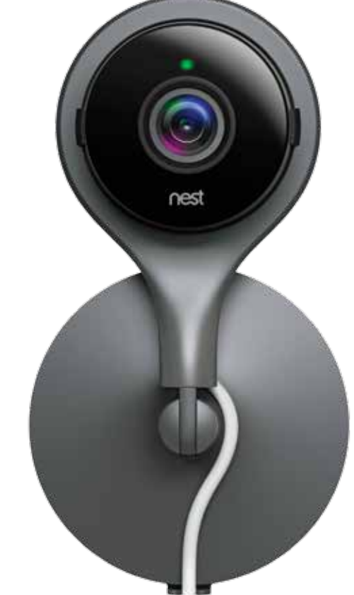
Nest Camera allows you to watch your home from your phone while you're away ($200, nest.com)