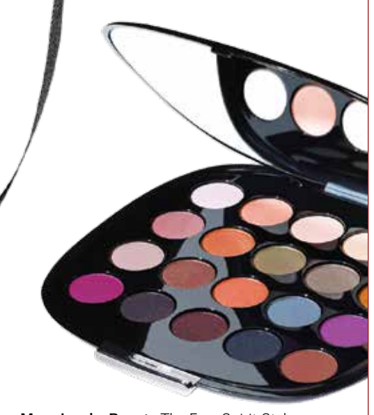
Marc Jacobs Beauty The Free Spirit Style Eye-Con No. 20 Plush Shadow is an entire palette of metallics, mattes, and sheens ($99, sephora.com)